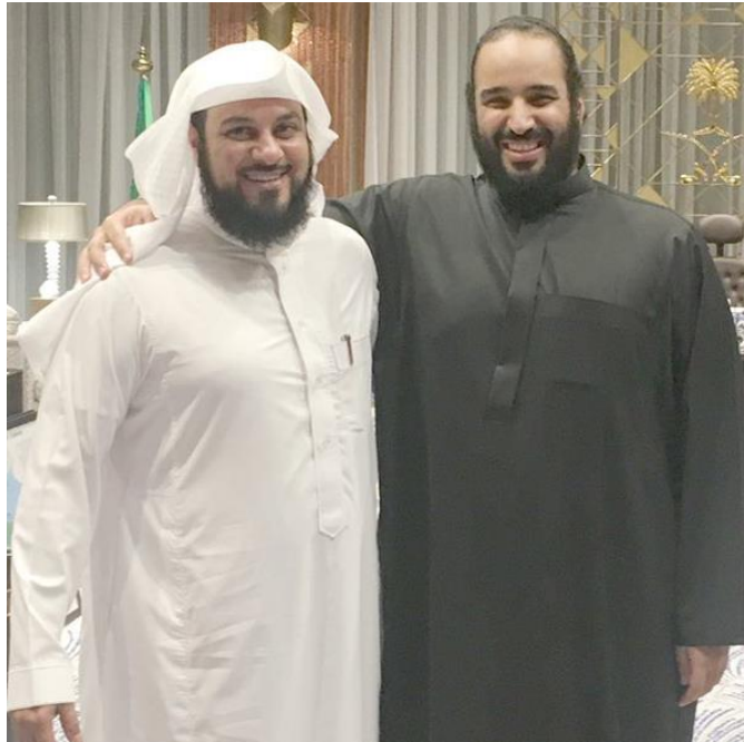
Bin Salman Saudi defense minister & son of king meets ISIS promoter Mohamed Alrefi, Dec. 2016